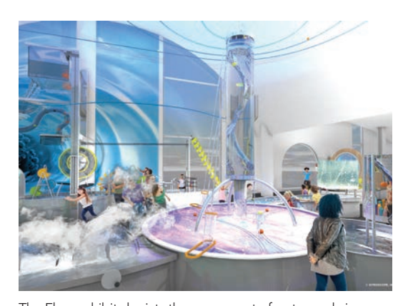
The Flow exhibit depicts the movement of water and air.