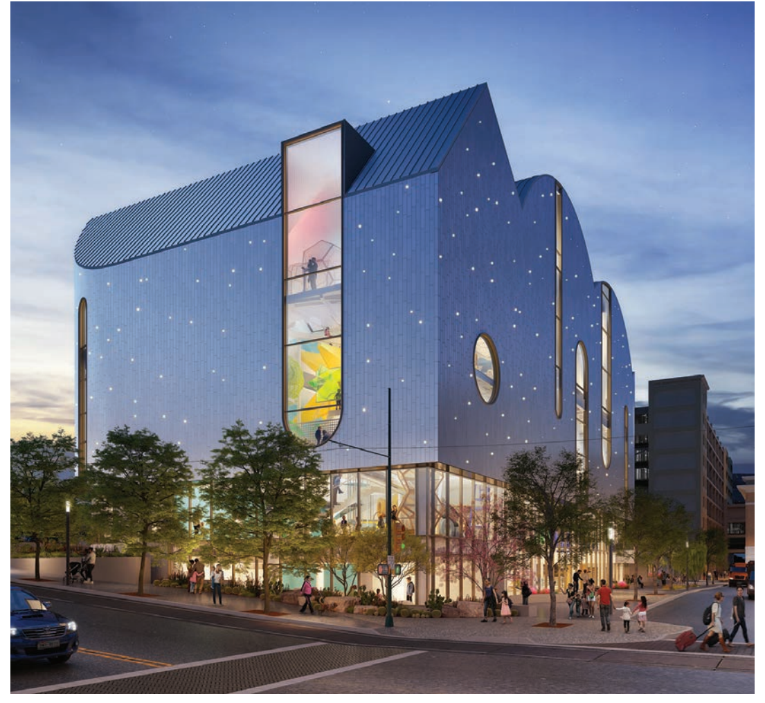
The stars come out at night in this exterior view from Santa Fe Street looking northeast.